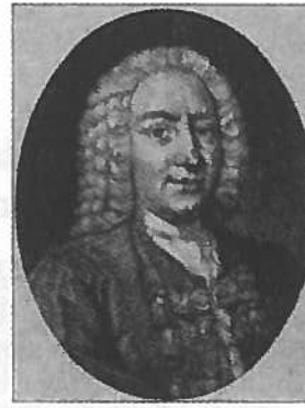
Daniel Bernoulli. Nach einem Porträt von J. Rudolph Huber, gestochen von Jakob Haid.

(mit Leibniz zusammen) usw. Er war auswärtiges Mitglied der Pariser Akademie seit 1699, der zu Berlin seit 1701, zu London seit 1712, zu Bologna seit 1724 und zu Petersburg seit 1725. Zu seinen Schülern gehörte ausser seinen Söhnen Niklaus, Daniel und Johann auch Leonhard Euler. † in Basel am 1. I. 1748. Unter Jakobs Söhnen zeichnete sich aus — 6. NIKLAUS, * 1687, Sohn von Nr. 3, Mathematiker, Jurist und Philosoph. Er widmete sich mit Vorliebe der Erforschung der unendlichen Reihen. 1716-1719 war er Professor der Mathematik an der Universität Padua; 1722 erhielt er in Basel die Professur der Logik, 1731 die des Codex und des Lehenrechts. Mitglied der Akademien von Berlin, London und Bologna. † 29. XI. 1759. Unter Johanns Söhnen (Nr. 7-9) sind zu nennen: — 7. NIKLAUS II., Mathematiker und Jurist, * 1695, Professor der Jurisprudenz in Bern 1723, kam 1725 mit seinem Bruder Daniel an die neu gegründete Akademie St. Petersburg, wo er schon am 26. VII. 1726 starb. Seine mathematischen Leistungen