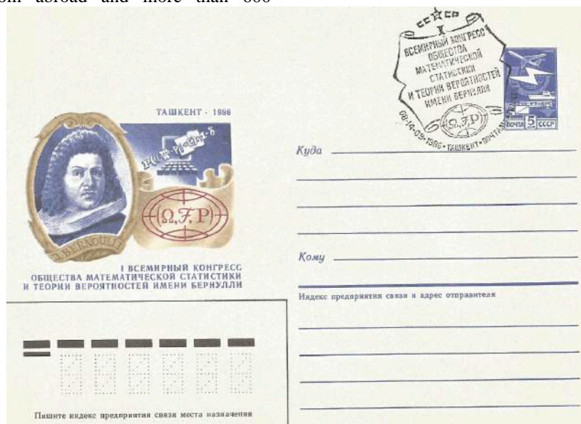
Special Envelope Issued by the USSR Postal Services, Commemorating the First World Congress

participants from the USSR. (Detailed information about Scientific Program of the congress: sections, talks and so on may be found in Theory of Probability and its Applications , 1987, 32:2, 199-200 and 384–385).