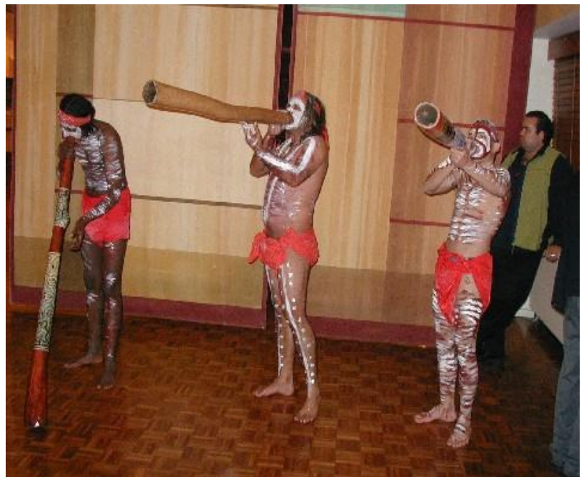
Conference entertainment: indigenous Australians playing didgeridoos

Photographs on this page reproduced by kind permission of the organisers of the 28th Conference on Stochastic Processes and their Applications.